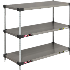
Shown as a tiered shelving unit.