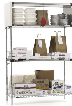
Shown with heated shelf, enclosure kit and standard Super Erecta shelving.