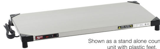
Shown as a stand alone counter-top unit with plastic feet.