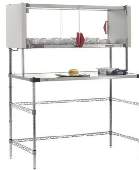
Heated shelf enclosure kit shown with a Super Erecta workstation.