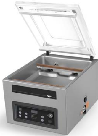
Vacuum Packing Machine with Dual 16" Sealing Bars