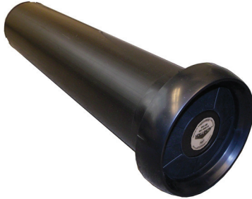
Gasket Style Cup Dispensers