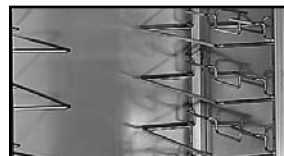
Adjustable Tray Ledges