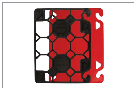
Frame & Board System to reduce costs and improve food safety