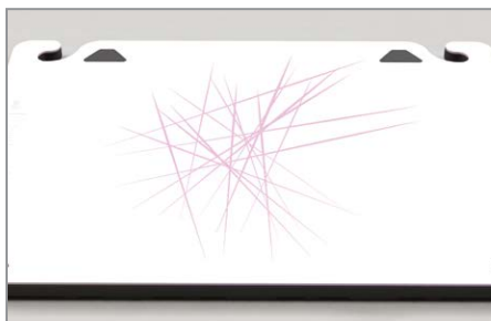
Smart Check Visual Indicator to alert for board replacement