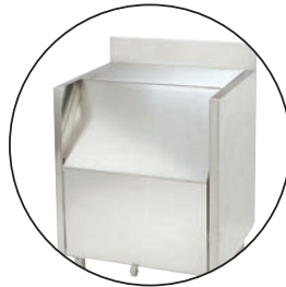
Optional Locking Cover Available - Includes Padlock & 2 Keys