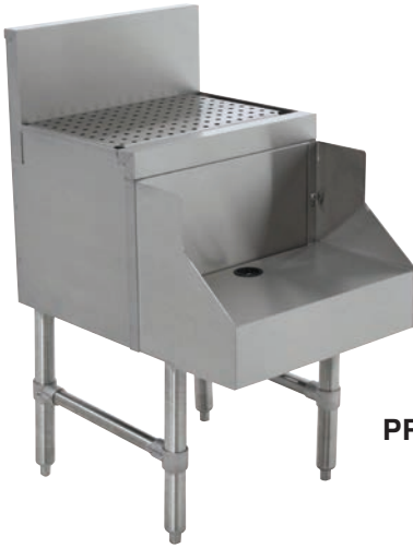
PRDB-19 Series 25" Wide Units