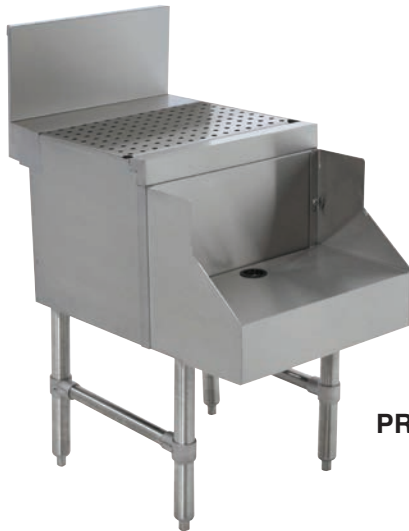
PRDB-24 Series 30" Wide Units