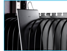
Built-in Compartments FOR STORING AND CHARGING YOUR TABLET/NETBOOKS