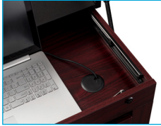
LOCKING LAPTOP COMPARTMENT