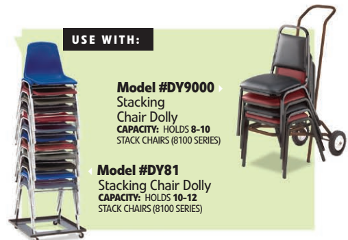
Model #DY9000 Stacking Chair Dolly CAPACITY: HOLDS 8-10 STACK CHAIRS (8100 SERIES)