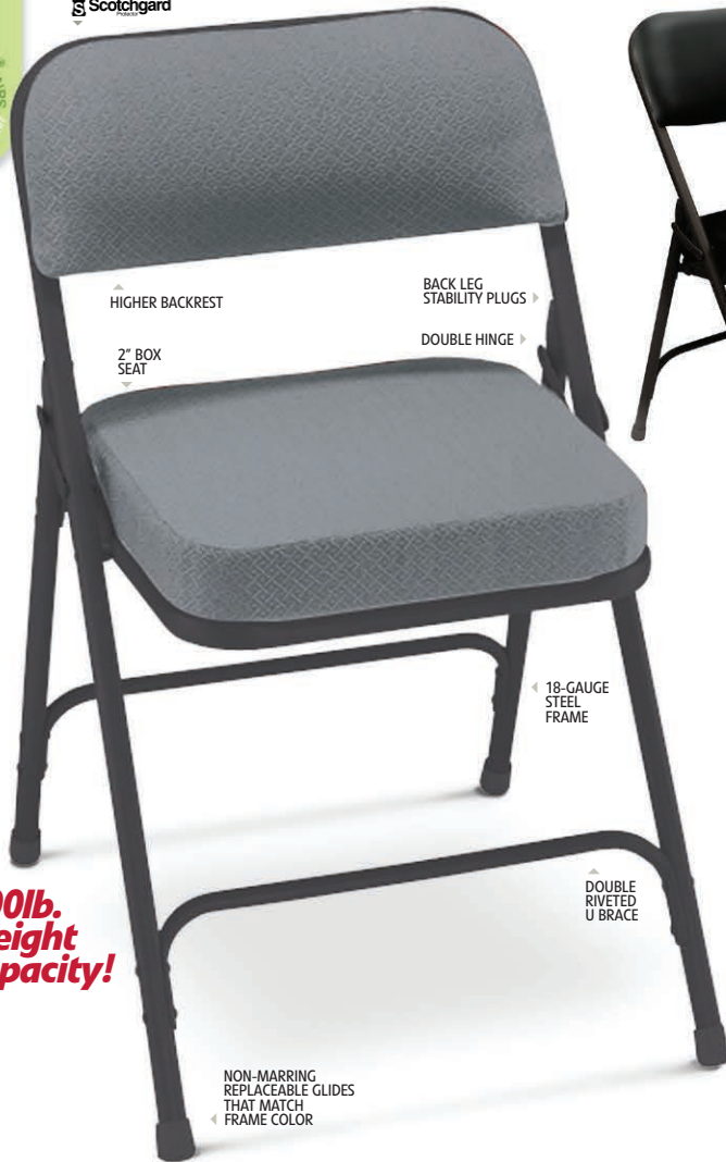
MODEL 3201 SHOWN