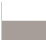
Glacier White/ Linen

The Moon sidechair features a low backrest with a wide ergonomic seat. Easy to handle and move around patios and terraces.