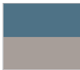
Storm Blue/ Linen