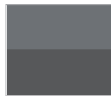
Titanium Gray/ Charcoal