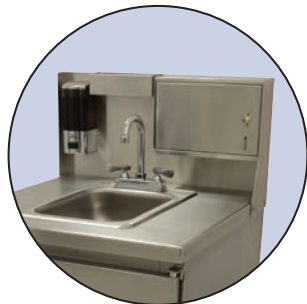
OPTIONAL TA-MSC-1 Shown

Conforms To NSF 61/9 Lead Free Requirements