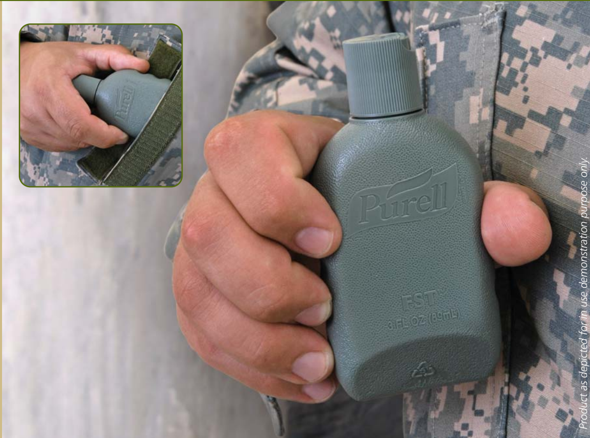
Product as depicted for in use demonstration purpose only.

A fist full of protection against germs that may make you sick.