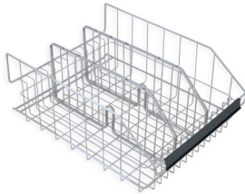
IBV1 (Dividers sold separately)