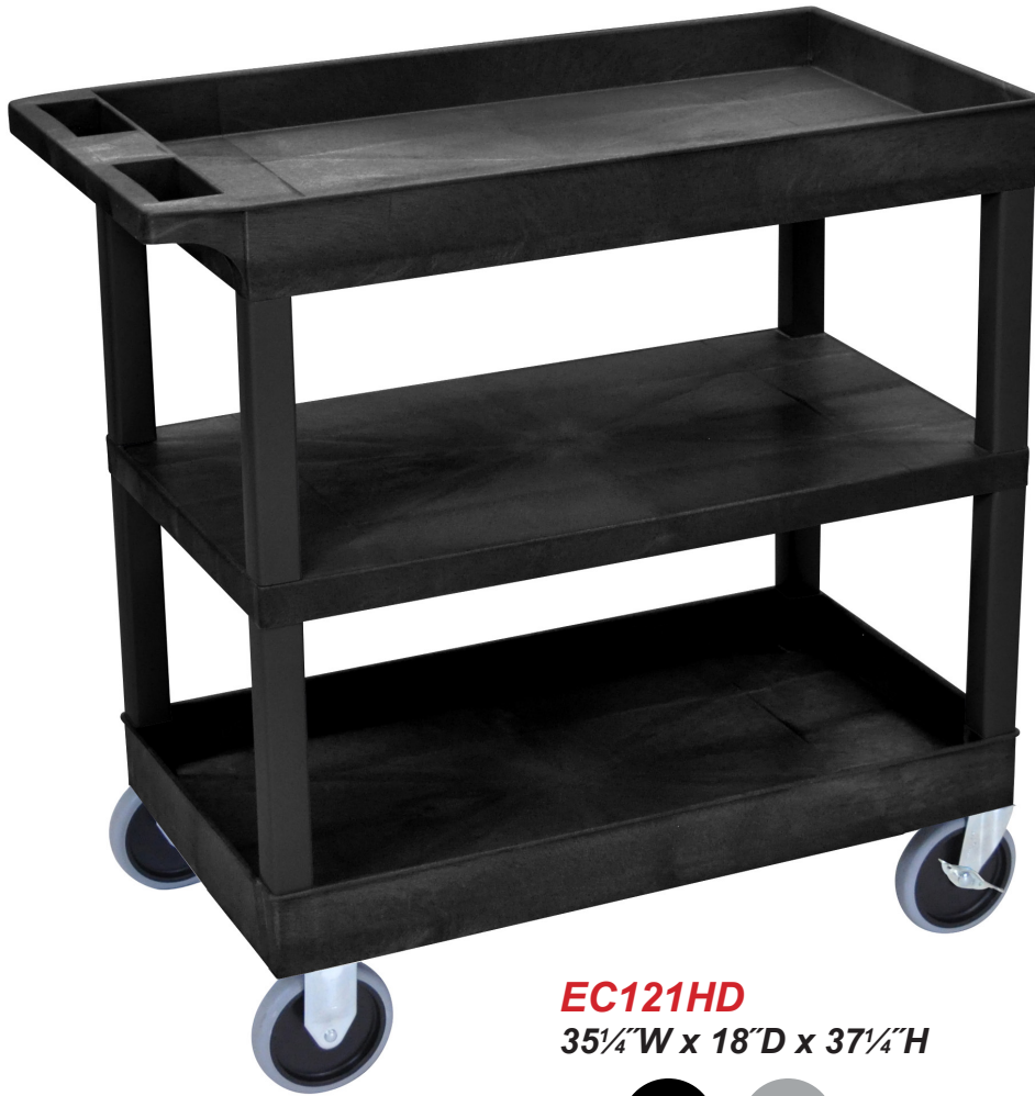
EC121HD 35 \frac{1}{4} "W x 18"D x 37 \frac{1}{4} "H