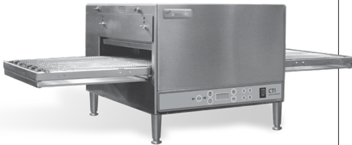
Shown with 50" (1270 mm) extended conveyor.