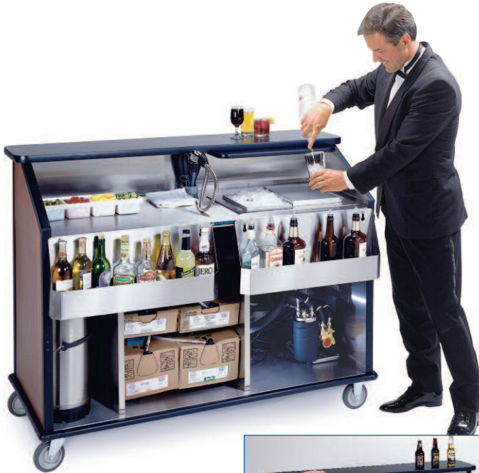
Model 889 shown with optional Post-Mix dispensing system and optional Bag-in Box rack kit.