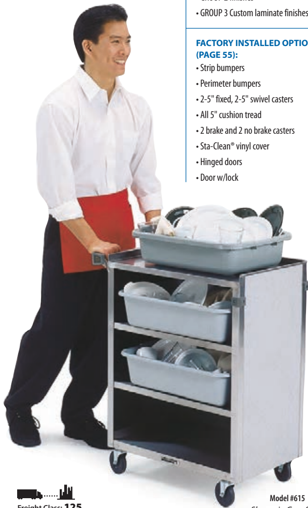
Model #615 Shown in Gray Sand