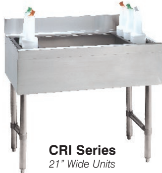
CRI Series 21" Wide Units