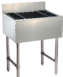
SLI Series 18" Wide Units