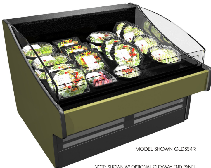
MODEL SHOWN GLDSS4R

NOTE: SHOWN W/ OPTIONAL CUTAWAY END PANEL