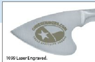
1099 Laser Engraved.