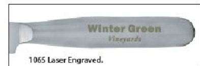
1065 Laser Engraved.