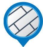
HARD FLOORS HEAVY USE

Laminate, Wood, Tile and other hard floor surfaces for moderate office and home use