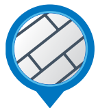
HARD FLOORS LIGHT USE

Over 1" thick including padding for intensive use and carpets over 1" thick