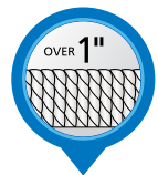
EXTRA-HIGH PILE CARPET

Up to 1" thick including padding for intensive use