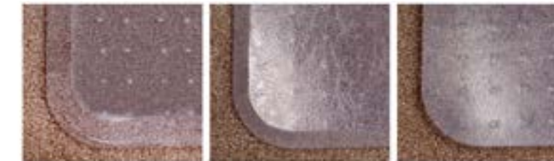
CRYSTAL EDGE BEVELED-EDGE® STRAIGHT EDGE

Carpet ChairMATS have the following edges (Individual item numbers will list available edge):