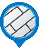
HARD FLOORS MODERATE USE

Laminate, Wood, Tile and other hard floor surfaces for occasional office and home use