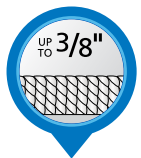
LOW PILE CARPET

Up to 1/4" thick including padding for home and light office applications