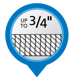
MEDIUM PILE CARPET

Up to 3/8" thick including padding for moderate use in home and office applications