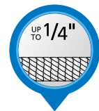
FLAT TO LOW PILE CARPET

Up to 1/8" thick no padding for occasional office and home use