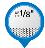
FLAT PILE CARPET

Up to 1/8" thick no padding for occasional office and home use