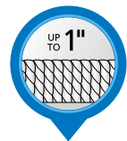
HIGH PILE CARPET

Up to 3/4" thick including padding for all day support in everyday office use