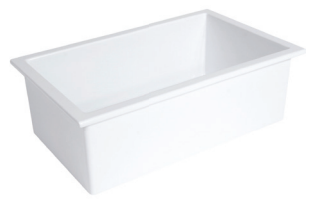
B414 - GN 1/4 10 3/8" x 6 3/8" x 3 3/4" h.