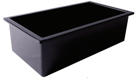
B127 - GN 1/3 12 3/4" x 6 7/8" x 3 3/4" h.