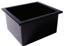
B16 - GN 1/6 6 7/8" x 6 3/8" x 3 3/4" h.