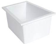
B19 - GN 1/9 6 7/8" x 4 1/4" x 3 3/4" h.

Give your presentation a modern look with the thin rim and straight sides of these food pans.