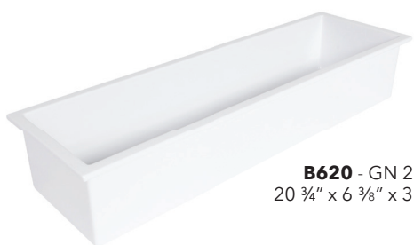
B620 - GN 2/4 20 3/4" x 6 3/8" x 3 3/4" h.