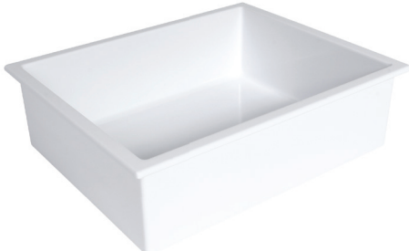
B1210 - GN 1/2 12 3/4" x 10 3/8" x 3 3/4" h.