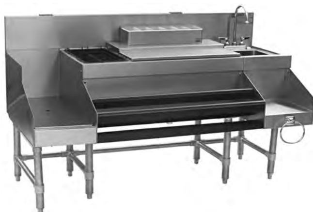
combination cocktail station

Eagle Spec-Bar® Combination Cocktail Station; model _____. Heavy gauge type 304 stainless steel body, legs, leg channels and cross rails. Models offered with (12" or 18") recessed workboard with 1½" drain and stainless steel removable perforated insert, or with (12" or 18") tiered liquor display with ABS for sound deadening—#CCS-72 has both. (36" or 42") combination foamed-in-place insulated ice chest with bottle holders. Two ¾" x 2½" tubing access holes in top of backsplash. Condiment dispenser. 12" single wet waste sink with T&S faucet and perforated lift-out strainer. Stainless steel blender shelf with towel ring and rear cord access hole. Stainless steel double speed rail with ABS for sound deadening, and stainless steel adjustable bullet feet.