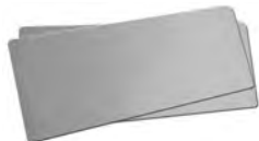
pair of end splashes for field installation