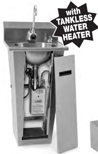
hand sink with hot water heater