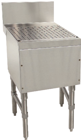
PRD-24 Series 25" Wide Units