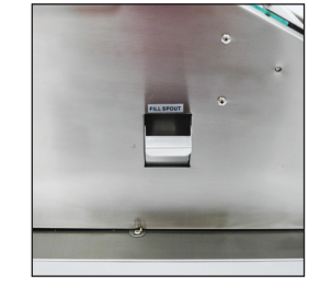
Side Water Fill For Easy Access