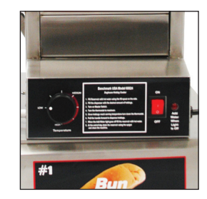
Easy to Operate with Adjustable Thermostat