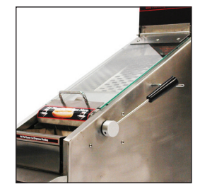
Innovative 'No-Touch' Dispensing