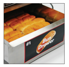
Stainless Drawer with 44 Bun Capacity