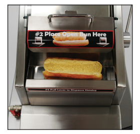
Easy Loading 24 Hotdog Capacity