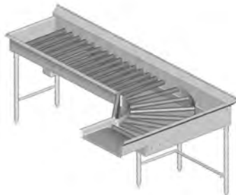
corner dishtable with optional PVC rollers