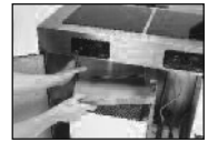
Each filtration unit slides out and top removes for quick and easy maintenance.