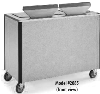
Model #2085 (front view)

Induction models with two or three cooktops feature a power management package as standard and require 220 VAC 50 amp circuit with NEMA 14-50P plug. On units that do not include the power management package, each 120 VAC induction cooktop requires its own 20 amp circuit. Filter(s) can be included on each circuit. Induction units available without Power Management Package.