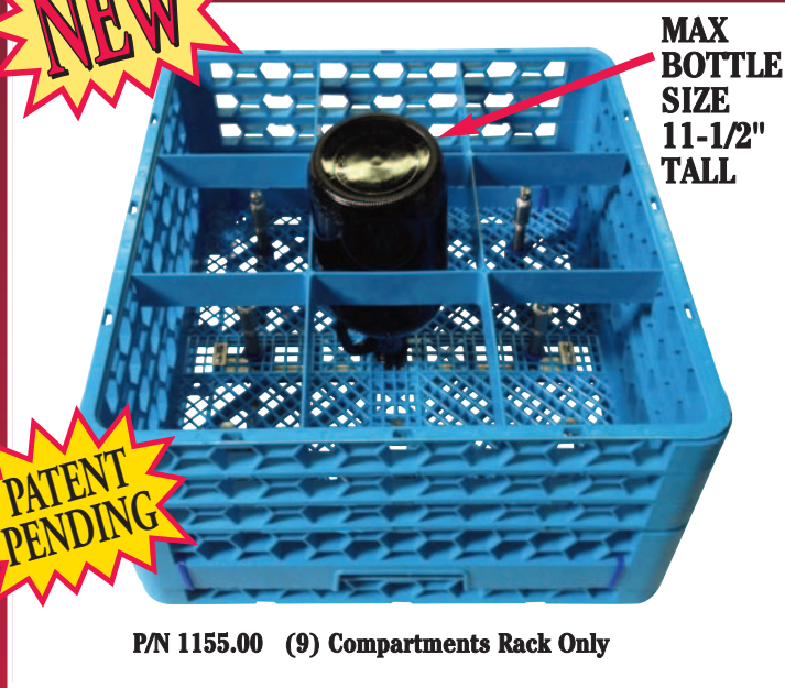
P/N 1155.00 (9) Compartments Rack Only

The standard Bottle Washer Rack has (9) compartments, holding up to 6" diameter bottles. The rack height is determined by the size of the bottle.