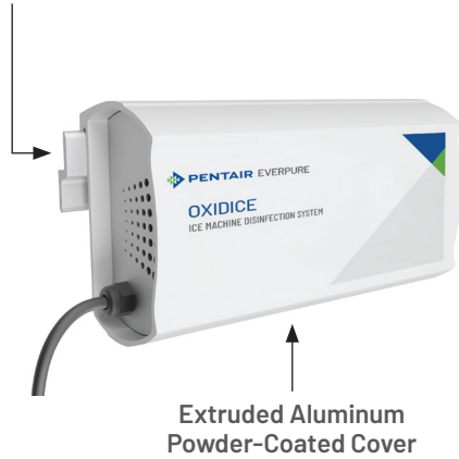
Z-Bar Mounting System