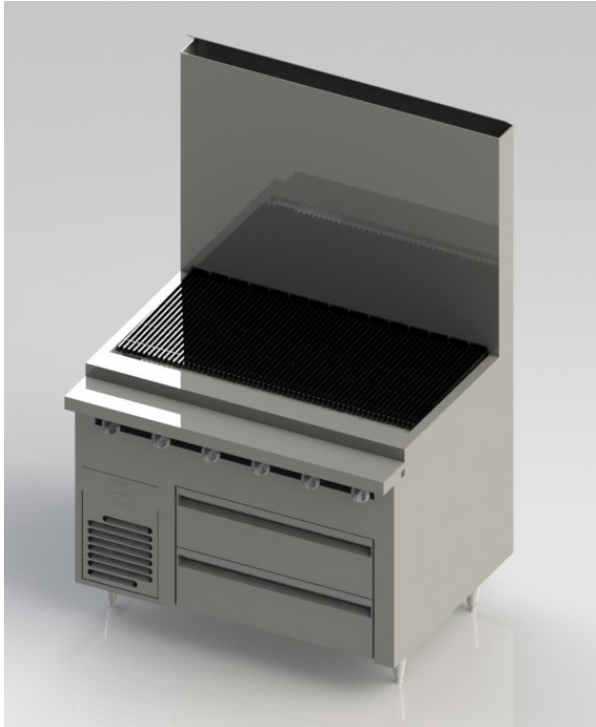
BRLH-02S-B-36 shown with BR-36B-M 36" Modular Base Charbroiler

Base Units for Use Under CAFE Modular Ranges