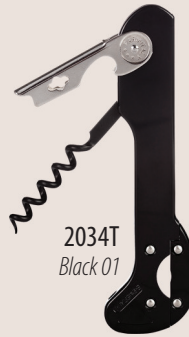
2034T Black 01