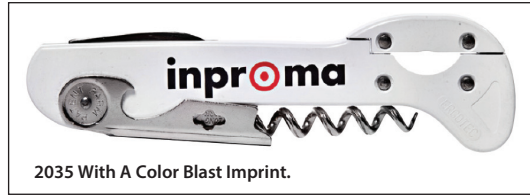
2035 With A Color Blast Imprint.