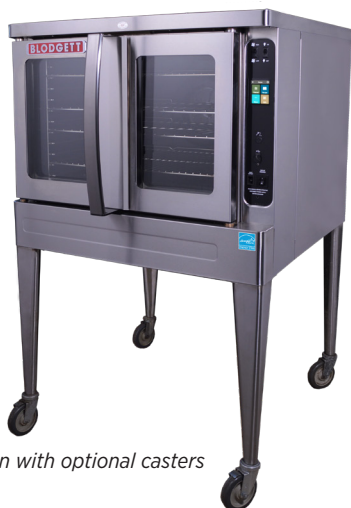
Shown with optional casters

Full-Size, Bakery Depth Dual Flow Gas Convection Oven