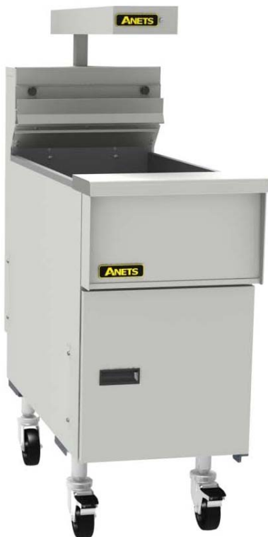
AHBNB18 with optional food warmer and casters