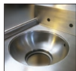
K-460A Disposal Cone w/ Control Bracket & Faucet Holes