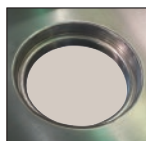
K-461A Install Collar w/ Control Bracket