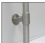
K-72 Leg-To-Wall Brace