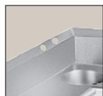
K-37 Anti-Siphon Vacuum Breaker Holes