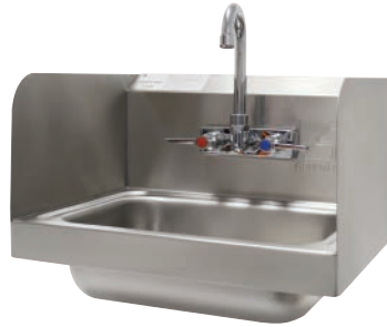
Welded Side Splashes Factory Installed Only