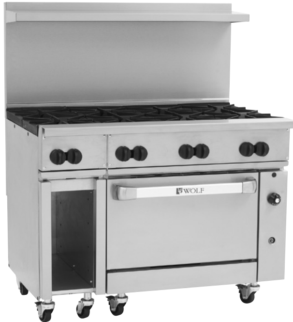
Model C48S-8BN (shown with optional casters)