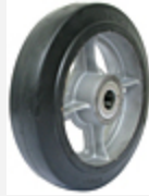
BT Cast Iron Center Moldon Rubber Wheel

(2) 10" Moldon Rubber, (2) 6" Moldon Rubber