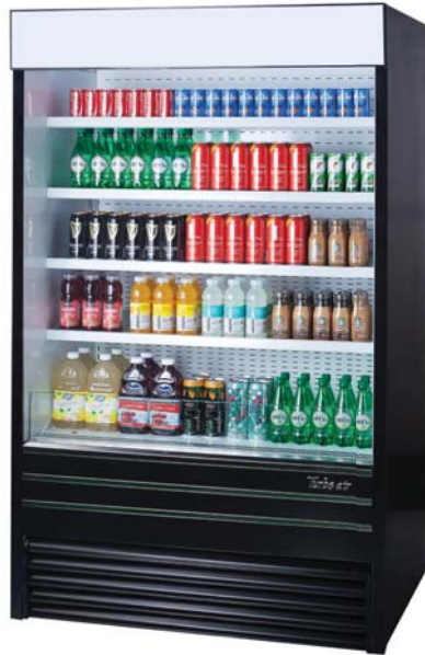
*Image shown here TOM-48EB-N