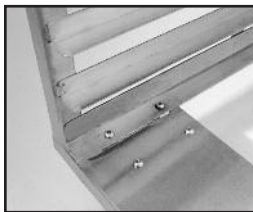
High strength heliarc welded ledges.