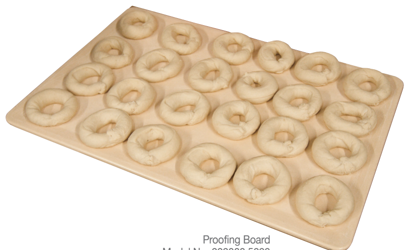
Proofing Board Model No. 222008 5299

Please contact your preferred distributor to order.