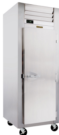
Model Shown One Section