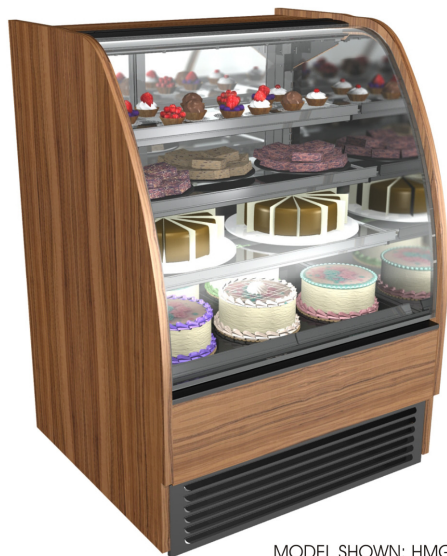
MODEL SHOWN: HMG3953R