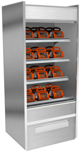
MODEL SHOWN: B3632H

NOTE: SHOWN WITH OPTIONAL STAINLESS STEEL EXTERIOR