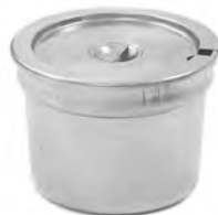
round inset and lid