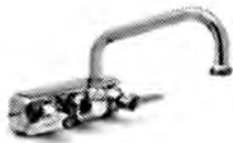
#313302 T&S faucet