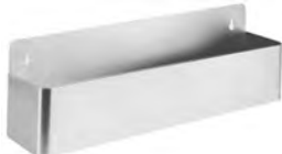
single-tier speed rail