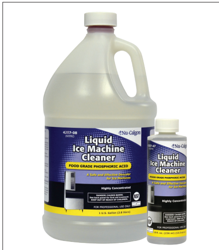
Liquid Ice Machine Cleaner