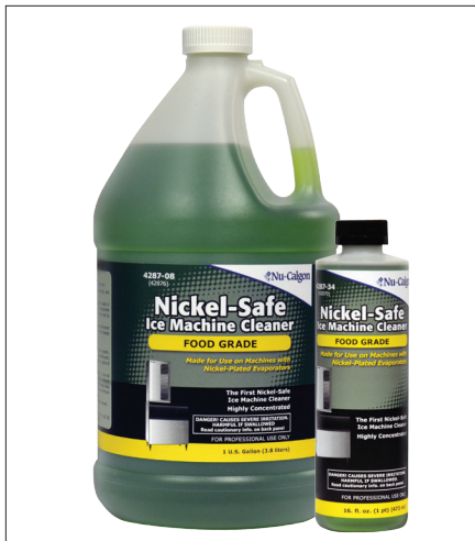
Nickel-Safe Ice Machine Cleaner

Nickel-Safe Ice Machine Cleaner is a specially formulated citric/phosphoric food-grade product for removing scale deposits from ice makers having nickel-plated or tin-plated evaporators. It is acceptable for use in machines made by Manitowoc and other manufacturers using nickel. In fact, it was the industry's first nickel-safe product, introduced in collaboration with Manitowoc. Usage rate should be in accordance with the manufacturers instructions or 16 fluid ounces with three gallons of system water.