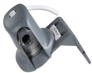
WATER FILTER HEAD, EQHP-VHD