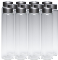
BOTTLES, GLASS WATER 12PK