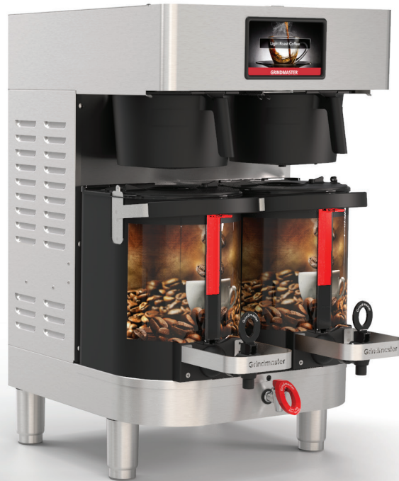
model PBC-2A air-heated Shuttles and graphics sold separately