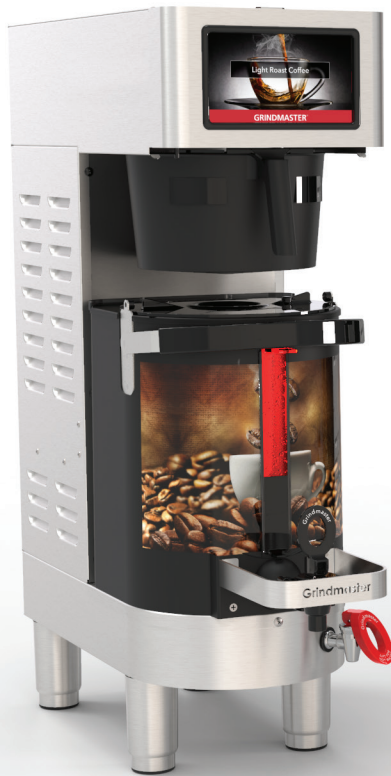
model PBC-1A air-heated Shuttles and graphics sold separately